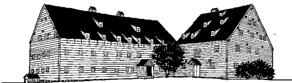
Saron (Sisters' House) and Saal (Meetinghouse)

T HE EPHRATA CLOISTER was founded in 1732 by Conrad Beissel, a German immigrant seeking the freedom of religion offered in Pennsylvania. At Ephrata, celibate Brothers and Sisters were supported by a married congregation of families called Householders. The life of the celibate members was characterized by strict discipline and self-denial of comfort. At the zenith of the community in the 1740s and 1750s, about 300 members worked and worshiped at the Cloister.